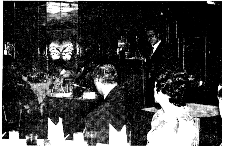
The president delivering his speech.